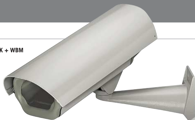
HEK30K + WBM