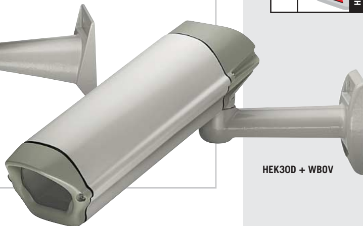
HEK30D + WBOV